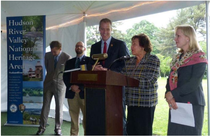
Congresswoman Lowey, flanked by Senator Gillibrand and Congressman Maloney, discusses National Heritage Area legislation in 2013

2014 saw great strides for the Greenway trail systems, both on land and on the water. Over 25 miles of new Greenway Trail were nominated for designation this year, and the Greenway began to develop an interactive, smartphone-optimized website and map series for trip planning. In May, the 104th Greenway Water Trail site was designated at Bard Rock on the National Park Service Vanderbilt Mansion property.