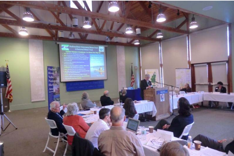
Discussion of the Hudson River Valley Greenway Strategic Plan at the October 2014 joint board meeting at the Wallace Center, F.D.R. Presidential Library and Museum

This year, the Hudson River Valley Greenway completed its first strategic plan in more than 20 years, produced by Greenway staff and board members in cooperation with Fairweather Consulting. The plan was the result of many meetings and consultation with Greenway partners and stakeholders and establishes valuable priorities in fundraising and partnerships specific to various Greenway projects, from water and land trail management to local community development. The vision outlined by this strategic plan will ensure the continued relevance, success, and sustainability of the Greenway for many more years.