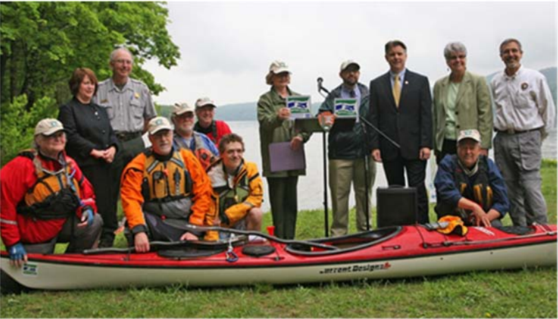
Elected officials, Greenway staff, and kayakers at the designation of the newest Water Trail site at Bard Rock, Vanderbilt Mansion NHS

This year, the Hudson River Valley Greenway completed its first strategic plan in more than 20 years, produced by Greenway staff and board members in cooperation with Fairweather Consulting. The plan was the result of many meetings and consultation with Greenway partners and stakeholders and establishes valuable priorities in fundraising and partnerships specific to various Greenway projects, from water and land trail management to local community development. The vision outlined by this strategic plan will ensure the continued relevance, success, and sustainability of the Greenway for many more years.