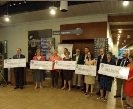
Above: Heritage Development Grant check presentation at Albany City Hall