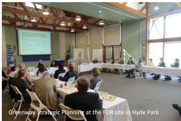
Greenway Strategic Planning at the FDR site in Hyde Park

The Greenway began 2014 by looking back on our history, our accomplishments, and our current challenges. This process would lead to the development and adoption of the organization's first strategic plan in more than 20 years. The plan was adopted by the board in October. The Greenway begins 2015 with a new course charted by our strategic plan. This new course will help ensure that we are relevant, successful, and sustainable for years to come.