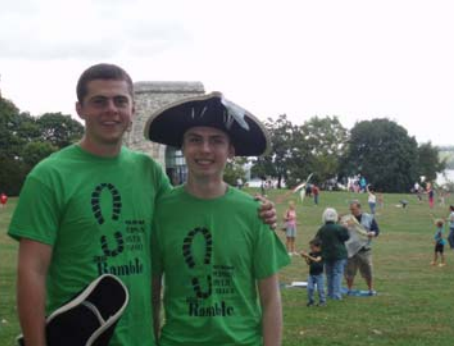
Hudson River Valley Ramble event at Washington's Headquarters State Historic Site

The Hudson River Valley National Heritage Area was designated by Congress in 1996 and is one of the now forty-nine federally-recognized National Heritage Areas throughout the United States. Through a partnership with the National Park Service, Hudson River Valley National Heritage Area collaborates with residents, government agencies, non-profit groups and private partners to interpret, preserve and celebrate the nationally-significant cultural and natural resources of the Hudson River Valley. In this way, we encourage public stewardship for these resources as well as economic activity at the local and regional level. The Heritage Area is managed by the Hudson River Valley Greenway.