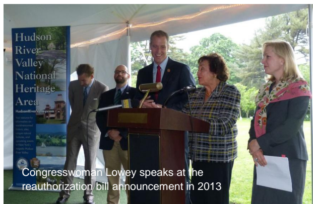
Congresswoman Lowey speaks at the reauthorization bill announcement in 2013

The Greenway and the National Heritage Area program represent a state-federal partnership and the results of that relationship are greater than the sum of its parts. This report provides a summary of the projects made possible through that partnership. In 2015, we will continue to build on these partnership projects and introduce new ones that implement our strategic plan. The plan confirmed for us that the essence of the Greenway is "making connections" and we know for our regional vision to succeed, we must make partnership a priority in every project.