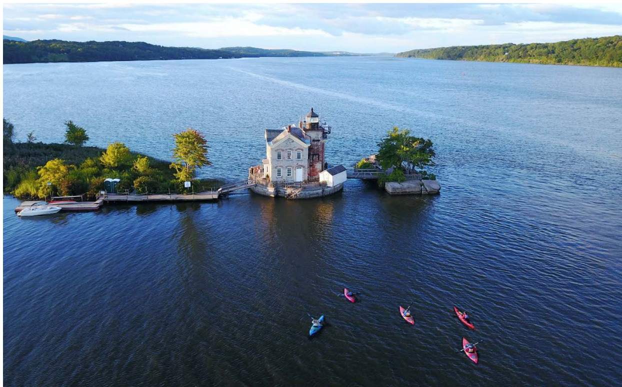
Hudson River Valley Ramble: Hudson Valley Sunset Paddle, Saugerties